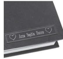
ONE-LINE NAME PLATE WITH TWO MARKS

One line of text engraved on a metal plate with choice of marks.