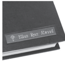
ONE-LINE NAME PLATE WITH ONE MARK

One line of text engraved on a metal plate with choice of mark.